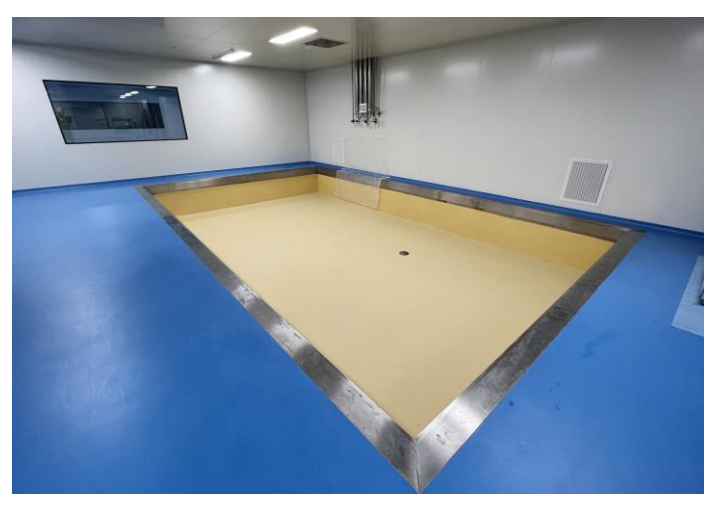
Our reference in Yunnan (China): Botanee Group Central Factory Project